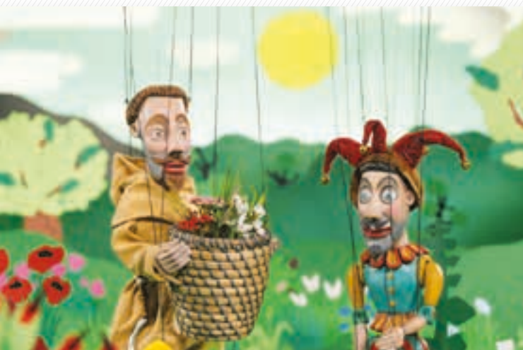
Chestnut Boy —

— Compared to 2019, fewer projects premiered in