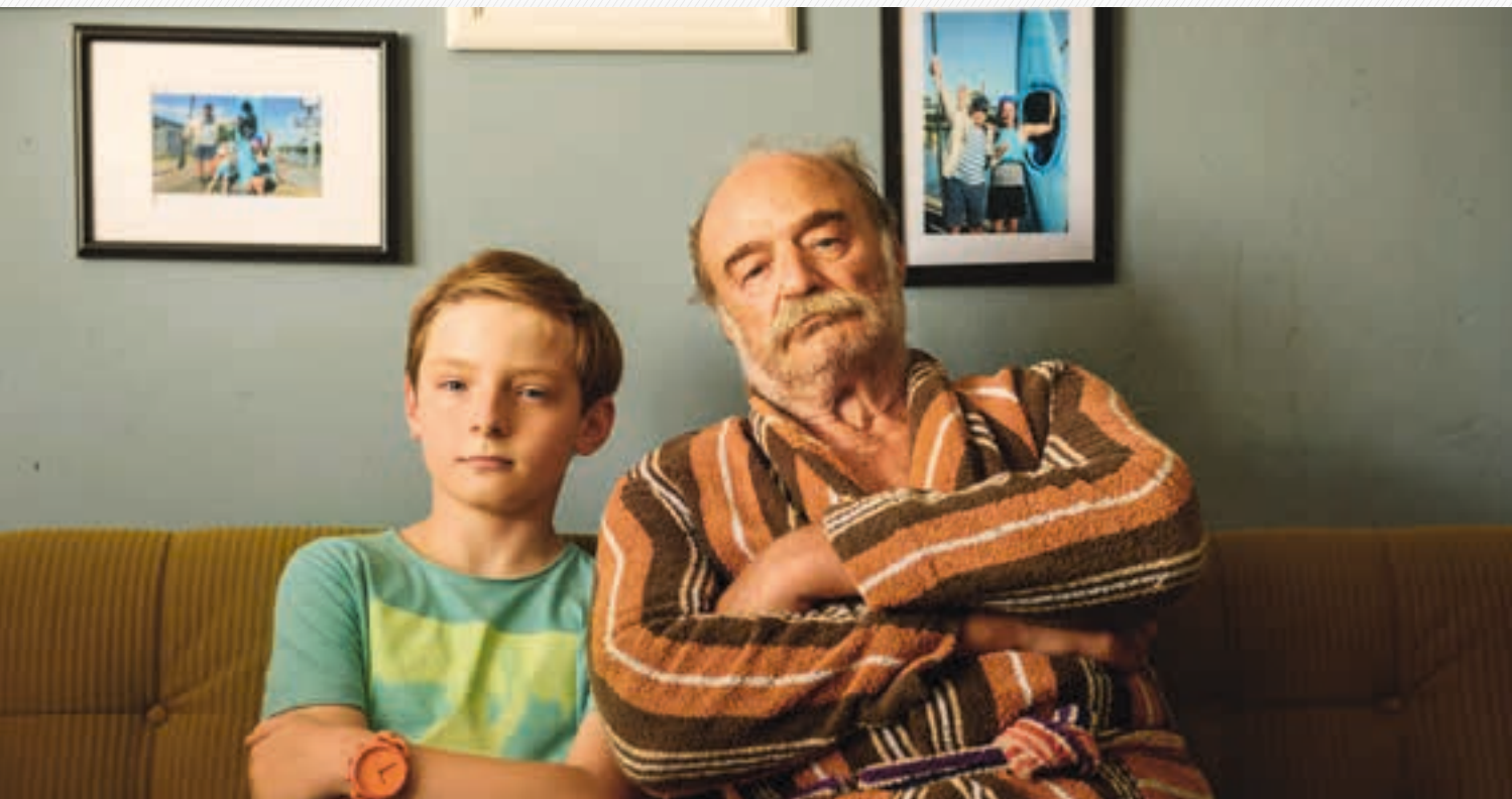
Summer Rebels —

History of Slovak Cinematography from 1997, has meanwhile become a cult classic in certain circles, remaining one of the films that most convincingly depict the atmosphere of the "Wild 1990s". The trio of undisguised sexist friends roam the neglected Bratislava, appearing as postmodern players and flaneurs at the same time, in anticipation of a monetary reward for masking the tracks of a thief of Andy Warhol's painting. Calling themselves actors, they bear the names of the real actors who portray them. Their actions are often impulsive, the expression affected. Like the heroes of the early films of directors Juraj Jakubisko and Elo Havetta, the characters do not have a job and avoid stable partnerships. Instead, they indulge in their own feelings of madness and playfulness. The film expresses concern about the values of the lost generation of the thirty-somethings and emphasises the thin line