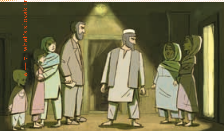
My Sunny Maad —