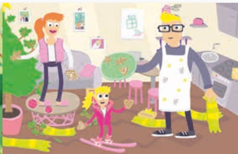
Cate Strophe Saving Christmas —