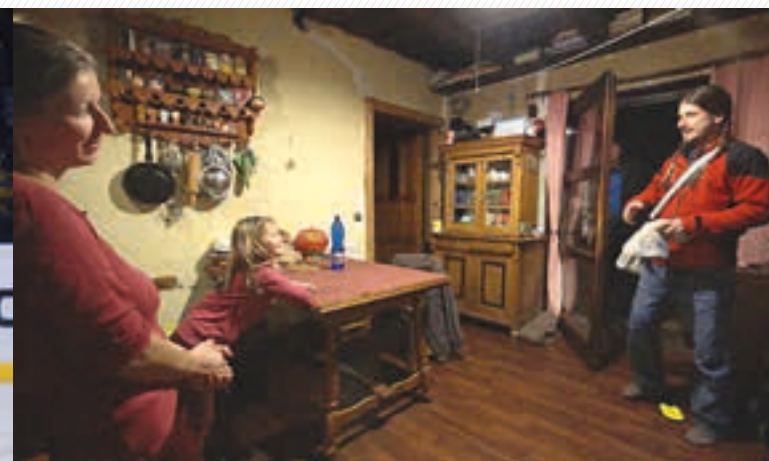
The Golden Land —