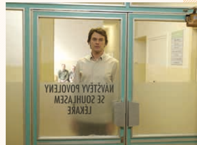
Saving One Who Was Dead —

— Kadrnka’s film was awarded at the Hong Kong Asia Film Financing Forum (March 15 – 17). The HAF Goes to Cannes Award enables the participation in one of the most prestigious film markets in Cannes (July 6 – 15). Saving One Who Was Dead was awarded at the Asian Forum also in 2018, when it was in the development phase. It received the main HAF Award for the best international