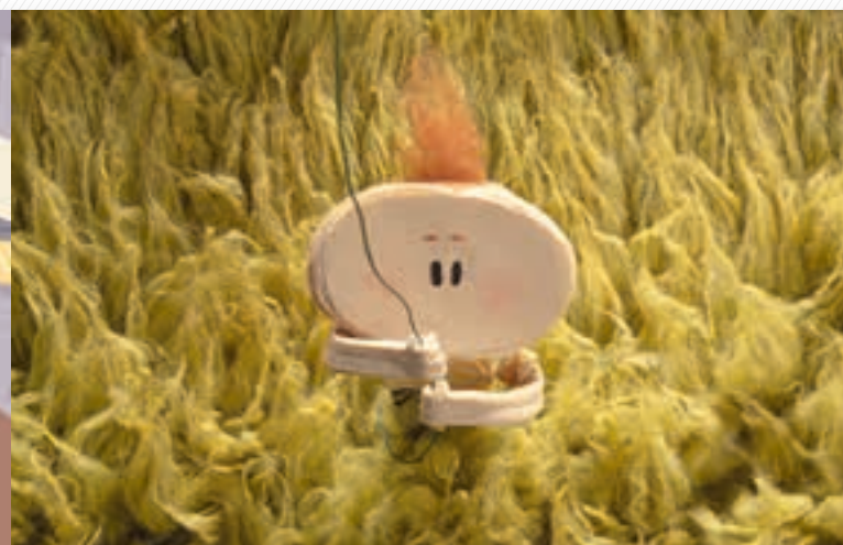
The Kite —