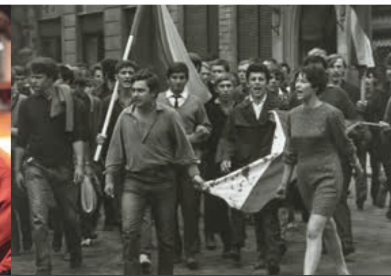
Reconstruction of the Occupation —

claims that he was assaulted by three young Roma. His mother Irina demands justice and is met with great solidarity by her new society. The mother is ready to stand by her son no matter what. Until the moment she realises that his narrative is full of loopholes.