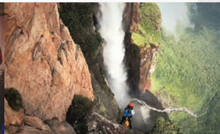
Salto Is the King —

some time to see if Rytmus is to become a legend like Meky, or how many documents will be made about the #1 Slovak rapper until then.