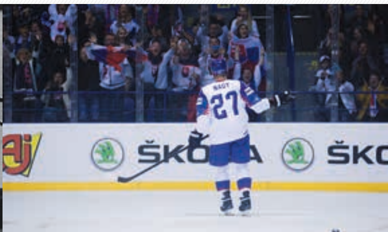
Ice-Hockey Dream —