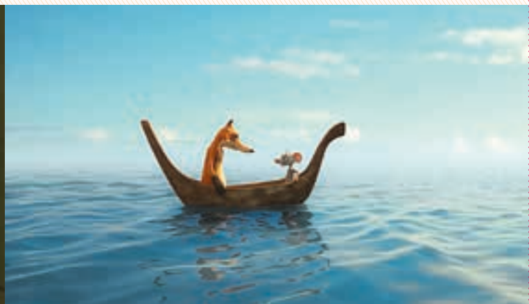
Even Mice Belong in Heaven —