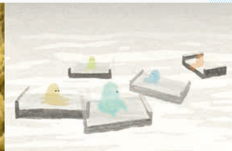
Forget Me Not —

when set in juxtaposition with the story.