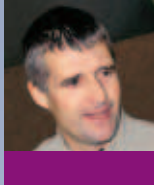
PAVOL BARABÁŠ [1959] [SELECTED DOCUMENTARIES]