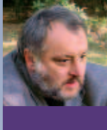
MARTIN ŠULÍK [1962]