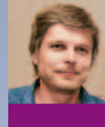
MARKO ŠKOP [1974]

AWARDS: AUDIENCE AWARD AND SPECIAL MENTION – BEST DOCUMENTARY FILM – KARLOVY VARY IFF 2006 >> TALENT TAUBE – DOK-LEIPZIG 2006 >> GRAND PRIX – EKOFILM ČESKÝ KRUMLOV 2006 >> EURO MEDIA AWARD, VIENNA 2006 >> PRIZE OF THE FILM CULTURE CLUB – LLF LAGÓW 2006 >> PRIZE OF THE DIRECTOR OF THE FESTIVAL – ETNOFILM ČADCA 2006