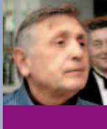
JIŘÍ MENZEL [1938] [SELECTED FILMS]