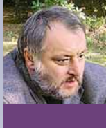
MARTIN ŠULÍK [1962]