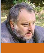
MARTIN ŠULÍK [1962]