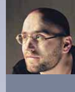
PETER KRIŠTÚFEK [1973] [SELECTED FILMS]