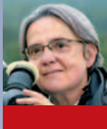
AGNIESZKA HOLLAND [1948] [SELECTED FILMS]