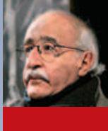
JURAJ HERZ [1934] [SELECTED FILMS]

The Czech State Fund for the Support and Development of Czech Cinematography