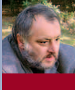
MARTIN ŠULÍK [1962] [SELECTED FILMS]

The Czech State Fund for the Support and Development of Czech Cinematography